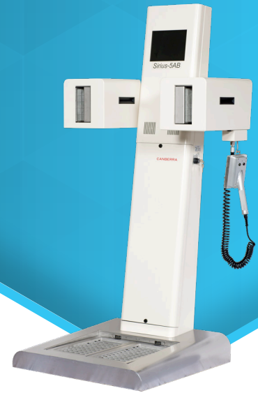
Sirius-5AB monitor with four hand/cuff detectors, two foot detectors and optional frisker.

Hand, Cuff and Foot Surface Contamination Monitors