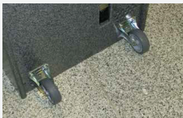
Transport Wheels Mounted castors and hand grip